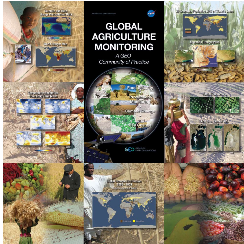
D) Climate Change